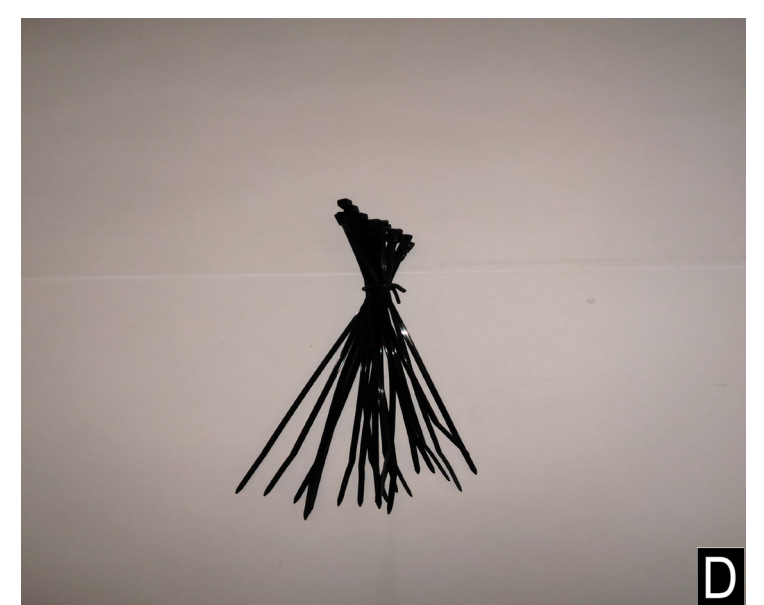
ProTip: Periodically check all hardware and re-tighten if needed.

For further assistance please contact us at customerservice@dragonfireracing.com or 1-800-708-9803.