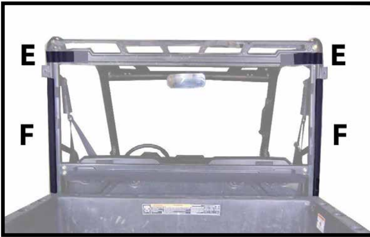
Figure 5: SHOWS PLACEMENT OF 10" AND 22" VELCRO STRIPS (E AND F)