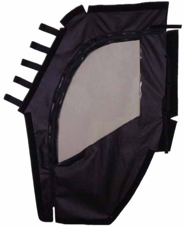
PASSENGER SIDE (INSIDE)

PICTURES SHOW THE SEWN-ON VELCRO TABS AND STRAPS THAT CORRESPOND TO THE VECRO CHART.