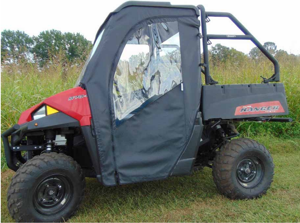
Figure 11: DOOR SHOULD RESEMBLE PHOTO WHEN INSTALLATION IS COMPLETE.