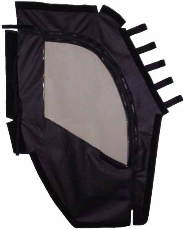
DRIVERS SIDE (INSIDE)