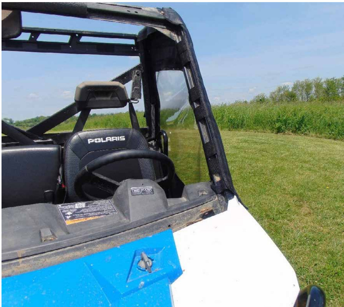
Figure 10: WHEN ATTACHING DOOR TO ADHESIVE VELCRO START WITH SIDE A. ALIGN BLACK TRIM ON THE DOOR PANEL TO THE EDGE OF THE INSET ROLL BAR. WRAP TABS AROUND THE INSIDE OF THE BAR AND ATTACH TO ADHESIVE VELCRO. CONTINUE TO ATTACH DOOR TABS AND STRAPS IN THE ORDER OF THE PICTURES AND VELCRO CHART.