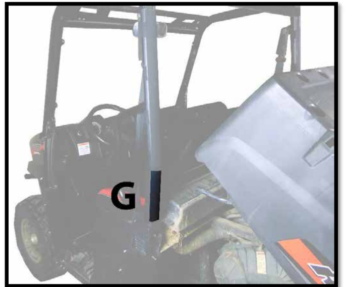
Figure 6: SHOWS PLACEMENT OF 9" VELCRO STRIPS (G)