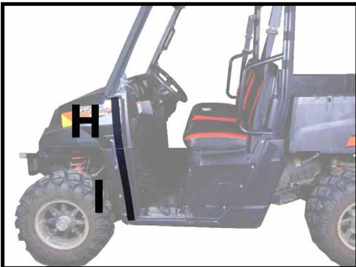
Figure 7: SHOWS PLACEMENT OF 10" AND 19" VELCRO STRIPS (H AND I)