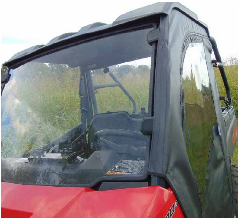
Figure 12: REINSTALL WINDSHIELD AND HARD TOP OVER THE DOOR KITS TABS AND STRAPS.