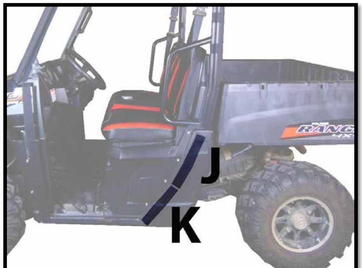
Figure 8: SHOWS PLACEMENT OF 13" VELCRO STRIPS (J AND K).