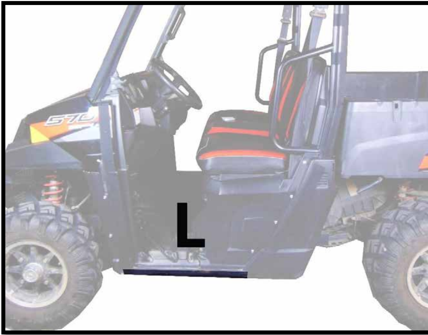
Figure 9: SHOWS PLACEMENT OF 22" VLECRO STRIPS (L)