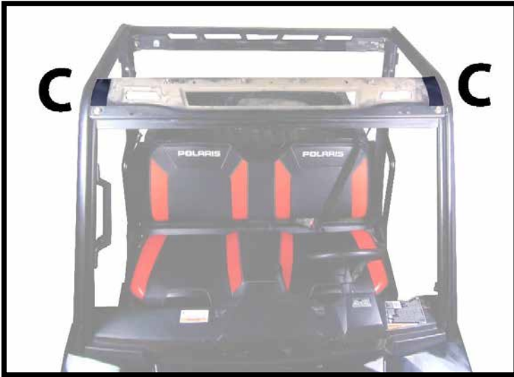
Figure 3: SHOWS PLACEMENT OF 7" VELCRO STRIP (C)