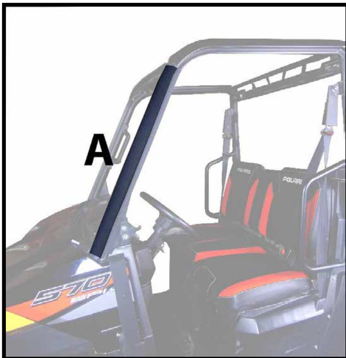
Figure 1: SHOWS PLACEMENT OF 26" VELCRO STRIPS (A) VELCRO. THE STRIP OF VELCRO SEWN ON TO THE DOOR WILL ATTACH TO THIS STRIP.