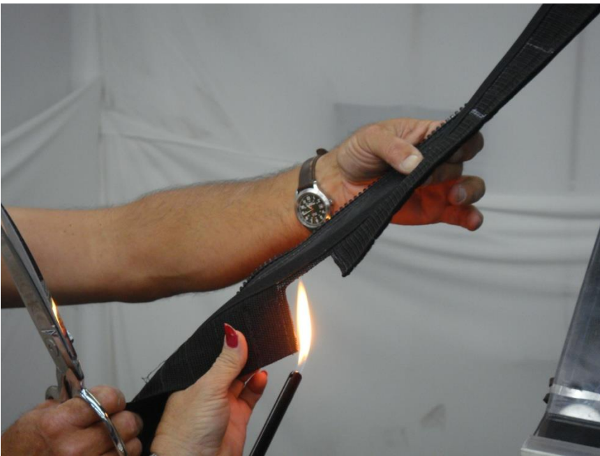
Figure 7.4 – Carefully burn the frayed thread around the cut area with a lighter.

Step 8: Zip Doors closed making sure the bottom door magnets attach to vehicle lower side Door Rocker Panel