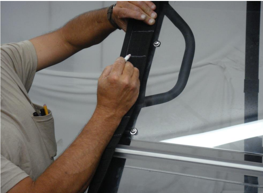
Figure 872 - Mark the Windshield Velcro Tabs for hard windshield Clamp locations