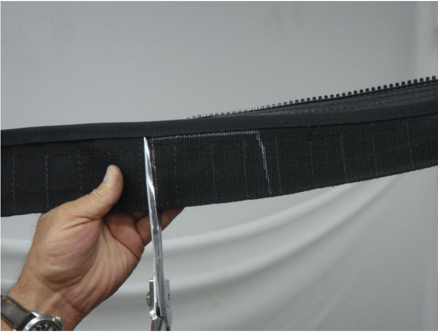
Figure 7.3 – Cut a 2” section out around where your clamps will be positioned on the Velcro Tab – be careful not to cut the binding